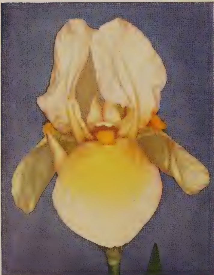
Fair Elaine—$1.00 (Page 11)